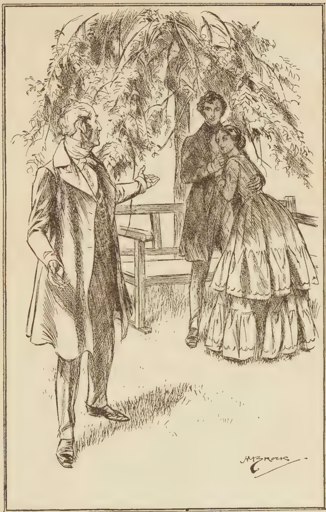
Mr. Jarndyce surrenders Esther and Bleak House